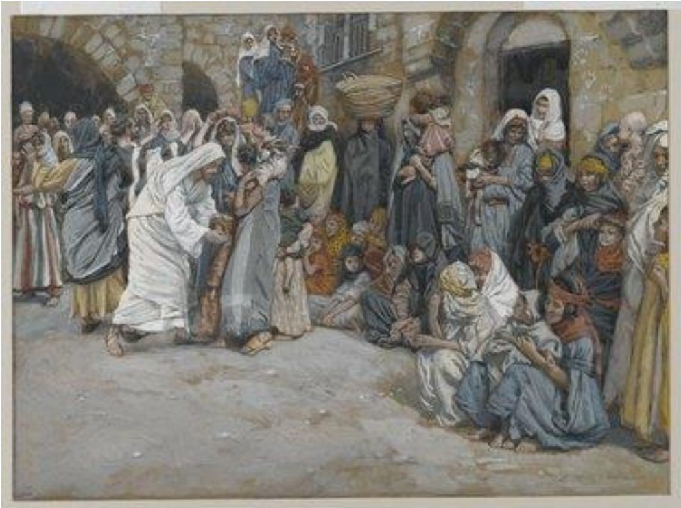
Suffer the Little Children to Come unto Me (Laisser venir à moi les petits enfants) 1886–1896 James Tissot